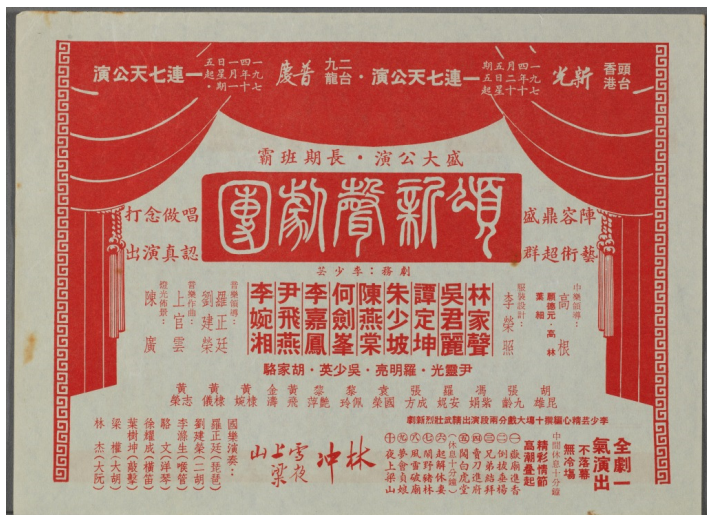
Handbill of the Chung Sun Sing Opera Troupe Repertoire: Lam Chung the Fugitive 1974 2010.46.21