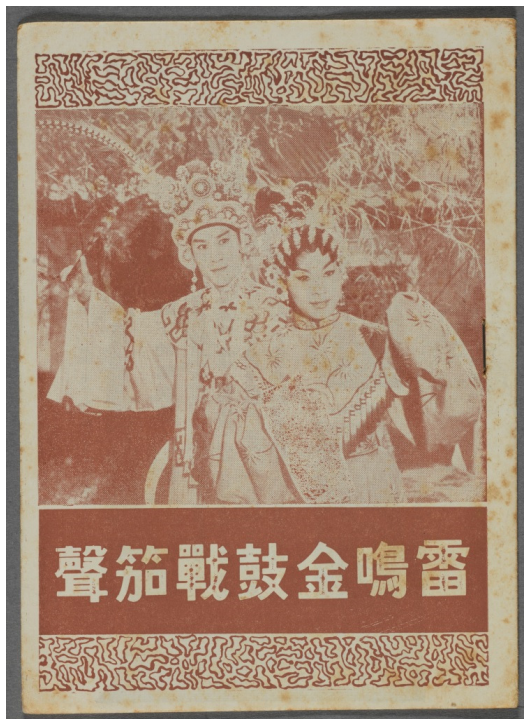
Special Film Issue of The Sounds of Battle