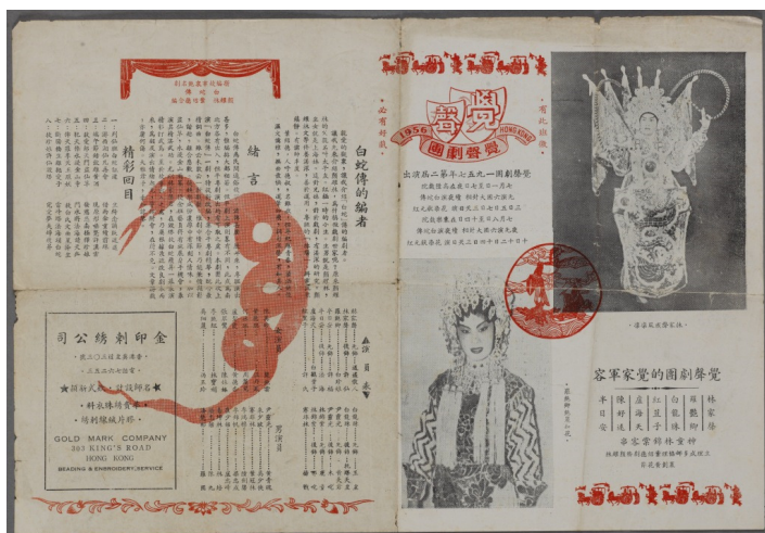
Handbill of the Kok Sing Opera Troupe Repertoire: The Legend of the White Snake 1957 2000.4.65