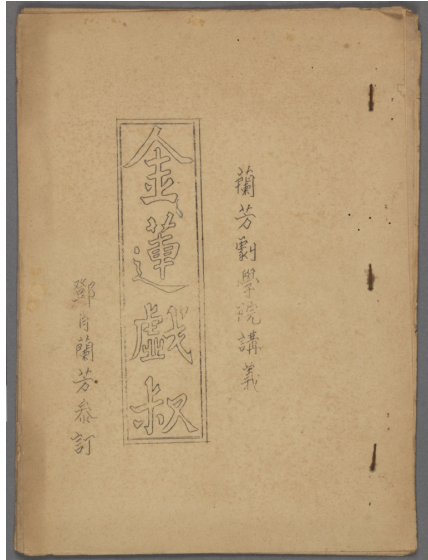
Lecture Notes of Lan Fong Training School Repertoire: Poon Kam Lin Teases Her Brother-in-law Early 1940s 2011.7.1116