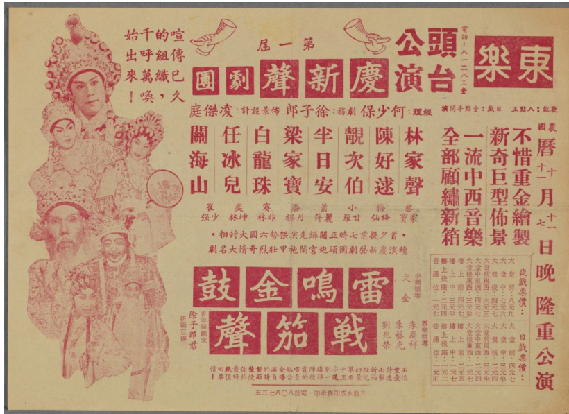
Handbill of the Debut of the Hing Sun Sing Opera Troupe Repertoire: The Sounds of Battle