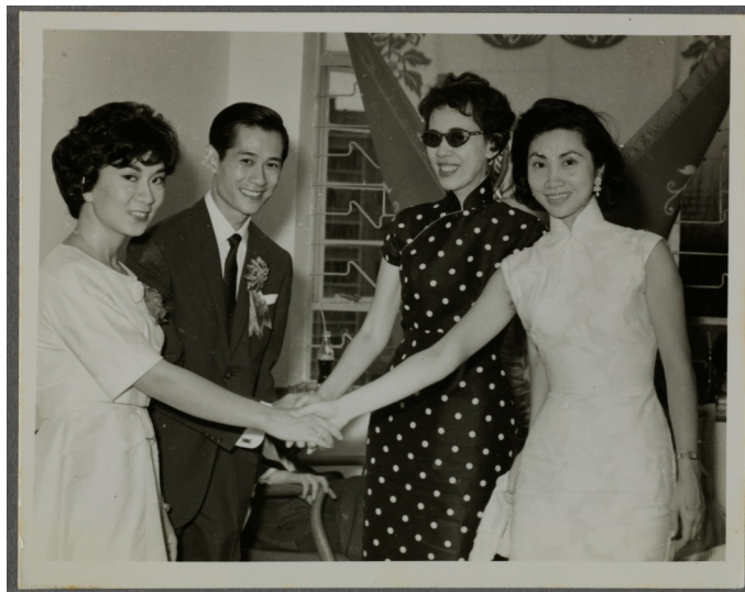
Pak Suet Sin and Yam Kim Fai offer their wedding wishes to Lam Kar Sing and Hung Tau Tzi.

The two had been married for almost 50 years when Hung passed away in 2009. She had suffered health problems in her later years, as has Lam, but they remained perfect partners. Knowing that Cantonese opera was her husband's lifelong pursuit, Hung encouraged him to write and publish a book that would explain the methodology of his art before she passed away. It was her spiritual support that helped Lam to continue to build his own legacy while courageously meeting the challenges that life threw in his path.