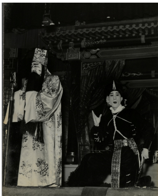
A Scene from the Opera The Regeneration in the Red-Plum Chamber , Performed by the Sin Fung Ming Opera Troupe (From right) Lam Kar Sing and Leung Seng Po 1959 2011.7.699