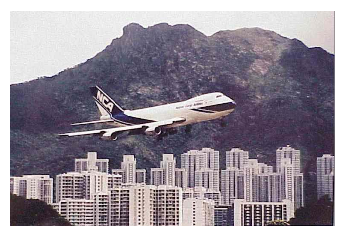
Homes for a Million

From the sale of the first batch of HOS flats in 1978, the HOS was well received by the public. Almost all the sale exercises were oversubscribed. In more recent years, as property prices fell drastically, HOS flats apparently lost their attractiveness. By the time the Government announced the indefinite cessation of the sale and production of HOS flats from 2003 onwards, they had accomplished their mission in the history of public housing in Hong Kong.