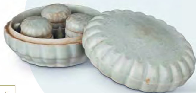
影青瓷奩 宋 (960 - 1279) Covered box in qingbai glaze Song dynasty (960 - 1279)

學習斷捨離，以保留有質感的生活日常！ Learn to declutter to improve your life!