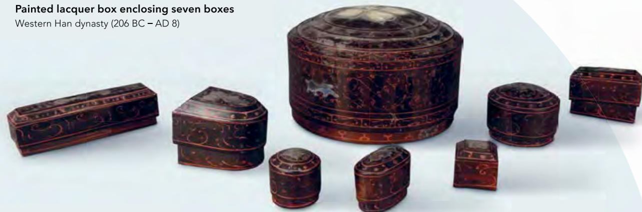
七子梳妝奩盒 西漢 (公元前206 - 公元8) Painted lacquer box enclosing seven boxes Western Han dynasty (206 BC - AD 8)

Beauty lies everywhere. Home organising should include stylish storage boxes.