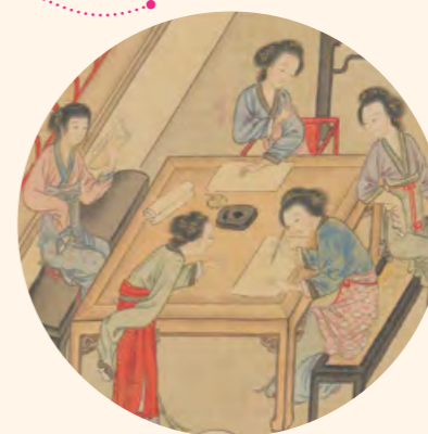
• CALLIGRAPHY • 書