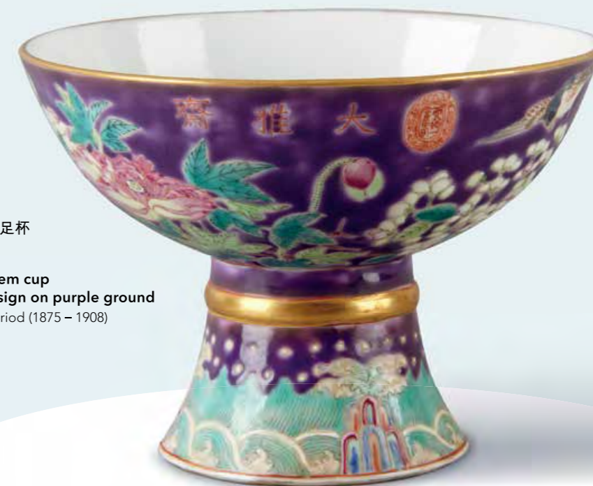
大雅齋紫地粉彩花鳥紋高足杯 清 光緒 (1875 – 1908)

Famille rose dayazhai flower pot with flower-and-bird design on yellow ground Qing dynasty Guangxu period (1875 – 1908)