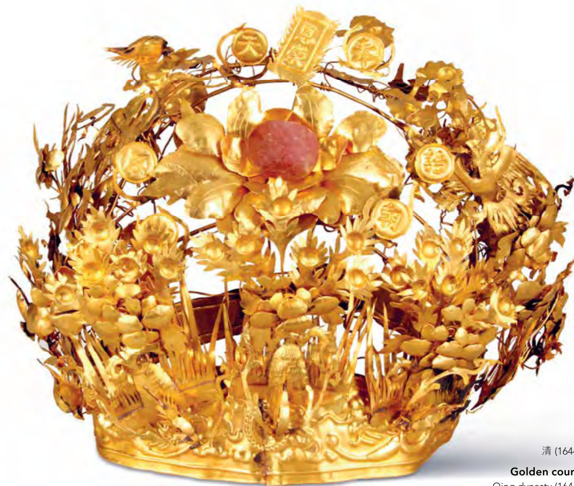
金朝冠 清 (1644 - 1911) Golden court crown Qing dynasty (1644 - 1911)

Looking at this golden court crown with sumptuous jewels, you can see that it is extraordinary. This court crown was worn by noblewomen who had been awarded aristocratic titles on formal occasions. It is decorated with a gem peony, phoenixes, flying dragons and flowers and adorned with small plaques carved with words. According to the court attire system, a noblewoman's title was awarded according to the official position of her husband or son, and her court crown was decorated with different ornaments corresponding to her rank.