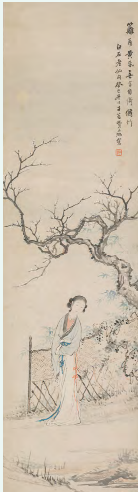
仕女圖 費丹旭 (1802 - 1850) 清 (1644 - 1911) Ladies in four seasons Fei Danxu (1802 - 1850) Qing dynasty (1644 - 1911)

Embrace an active lifestyle as much as a sedentary one, magnifying your beauty in all seasons.