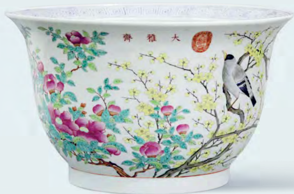
大雅齋粉彩瓷花盆 清 光緒 (1875 – 1908)

An Extraordinary Collection of Imperial Porcelain – Empress Dowager Cixi and her Studio of Great Elegance ( Dayazhai )