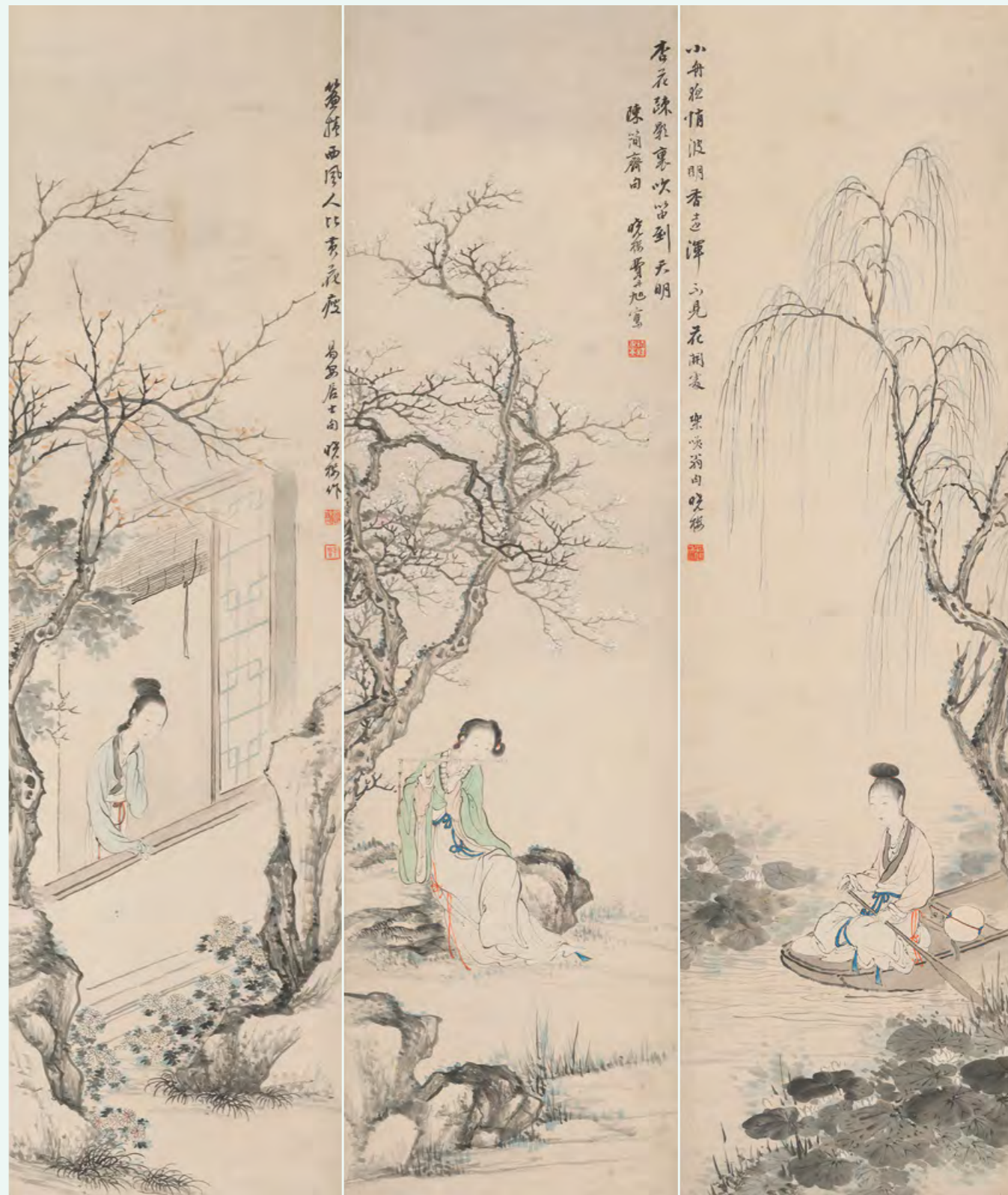
我的新嘗試：展現剛柔並濟的我 My new resolution: Connecting with both my femininity and masculinity