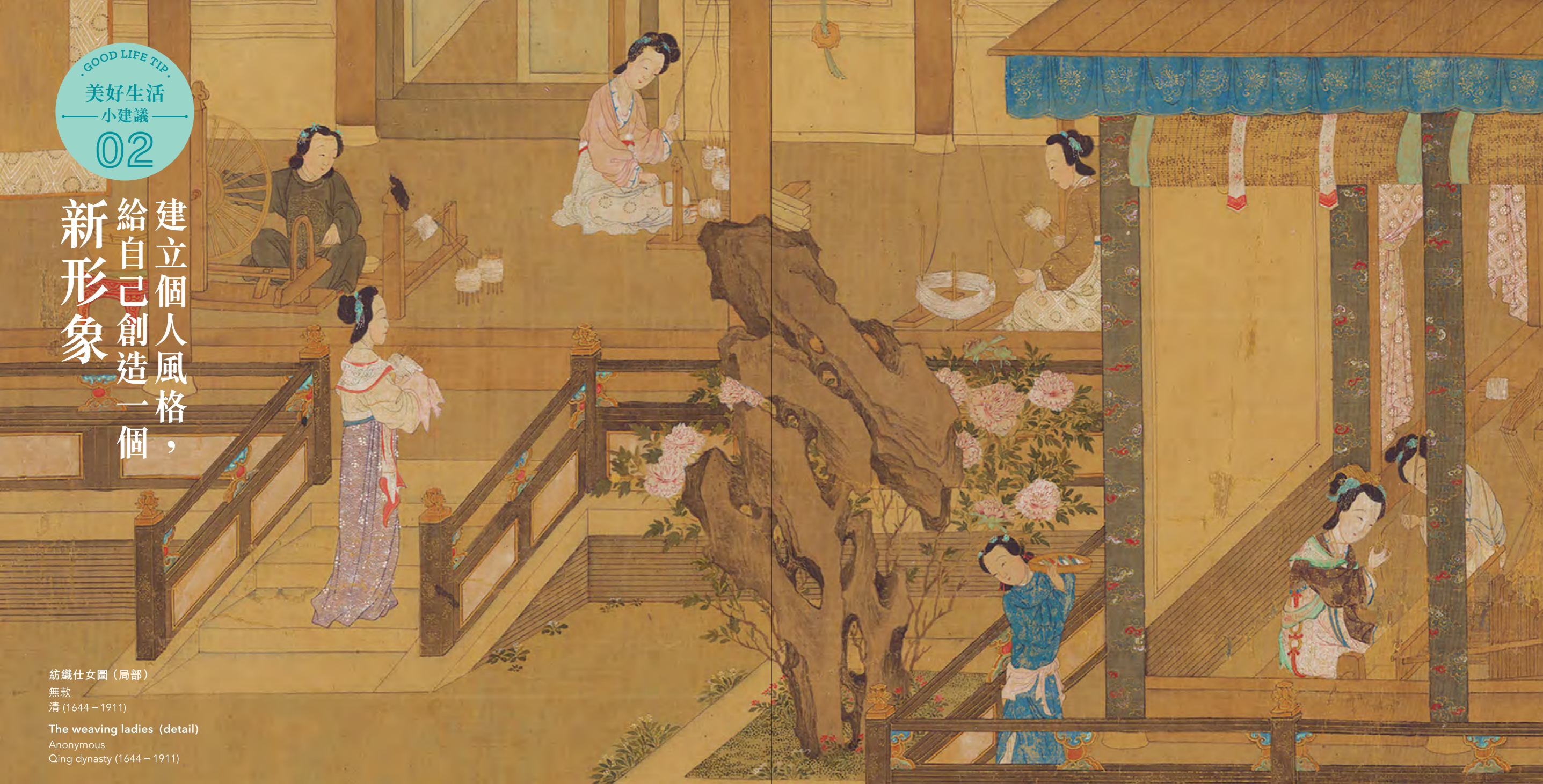
紡織仕女圖（局部） 無款 清（1644 - 1911）