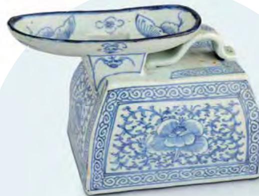
青花花卉紋女式瓷虎子 清 道光 (1821 - 1850) Porcelain urinal for women in underglaze blue Qing dynasty Daoguang period (1821 - 1850)

Keep clean and fresh at all times. Here are some must-have items for personal hygiene.