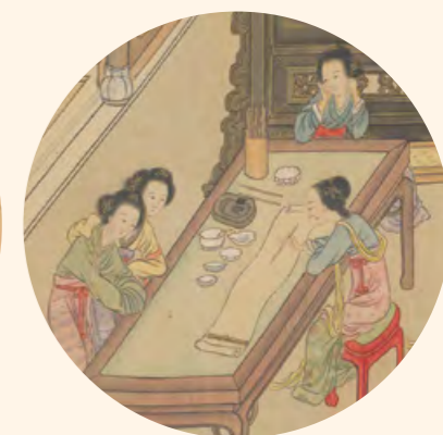
• PAINTING • 畫