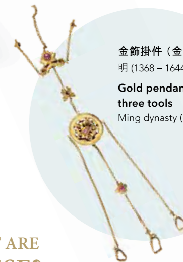
金飾掛件（金三事） 明 (1368 - 1644) Gold pendant with three tools Ming dynasty (1368 - 1644)

至於「金三事」則是隨身佩帶的衛生用品，常見的掛件 工具是耳挖、牙簽和類似眉鉗的鑷子，有時也可達四 件、八件之數，視乎用家需要。實用之餘，更是精美 佩飾。