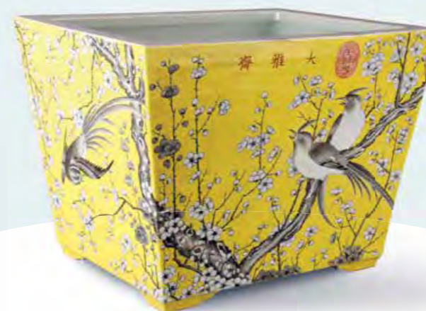
大雅齋黃地粉彩花盆 清 光緒 (1875 – 1908)

Famille rose dayazhai flower pot with flower-and-bird design on yellow ground Qing dynasty Guangxu period (1875 – 1908)